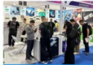
Guangzhou International Electronics