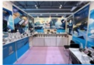
Global Sources Mobile Electronics