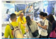
Shenzhen Gift Fair