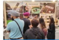
Global Sources Mobile Electronics